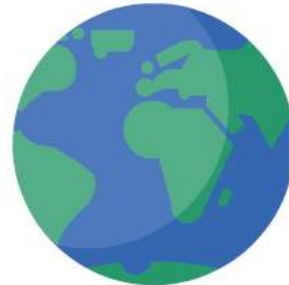
Special Immigrant Visas (e.g. Diversity Lottery)