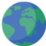
Special Immigrant Visas (e.g. Diversity Lottery)